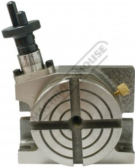
Front View on Edge