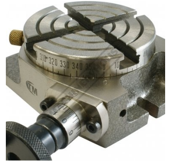
Graduated Rotary Table 360 Degrees