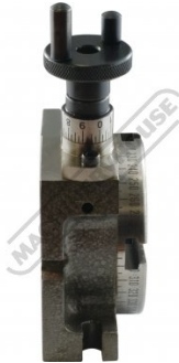
Side View on Edge