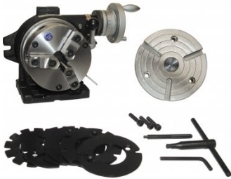
R002 Vertex Super Indexing Head