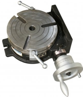
R008 Vertex Rotary Table