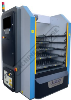
Operator Load side