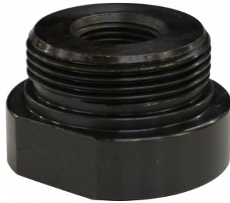
W367 Scroll Chuck Insert - 3/4" x 16TPI