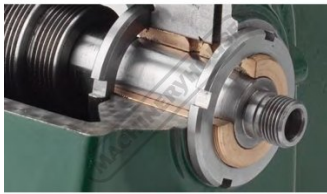
Phosphor Bronze Bearing