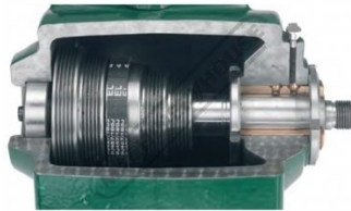
Cast Iron Headstock