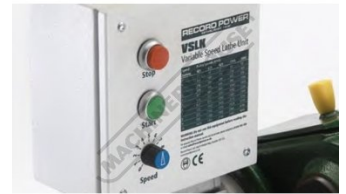
Variable Speed Unit