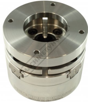
Shown With Faceplate Ring 62572