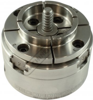
Shown With Wood Screw