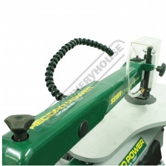
Blade Tension System