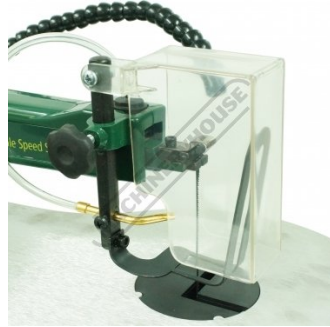
Adjustable Dust Blower and Safety Clamp