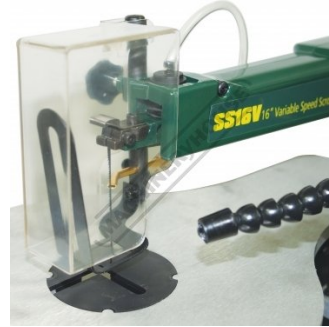
Integral Work Light