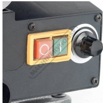
Smooth and Responsive Variable Speed