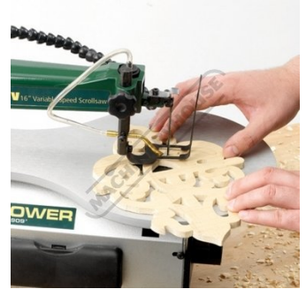
Intricate Fretwork Note guard removed for photo