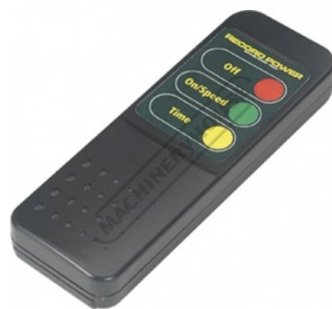
Remote Control Included