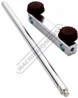
Support Arm Extension Kit