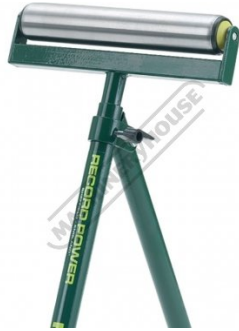
Rotating Height and Adjustable Head