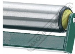
Sealed for Life Bearings