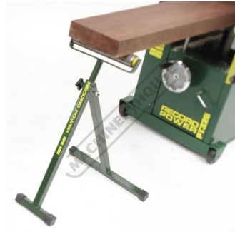
Shown in use with Thicknesser