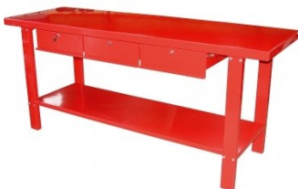
A380 Steel Work Bench - 3 x Lockable Drawers