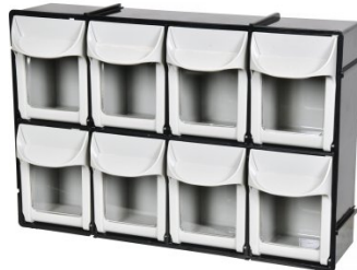
S0361 Parts Storage Bin System