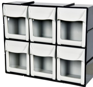
S0362 Parts Storage Bin System