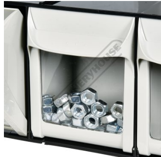
Clear Front Window to Easily Identify Parts