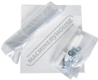
Includes Name Tags and Wall Mount Screws