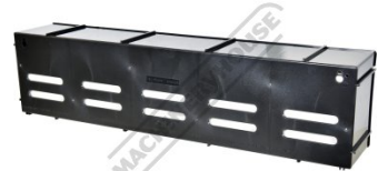
Rear Mounting Holes