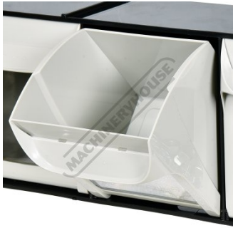
Bins Open to 40 Degree Angle