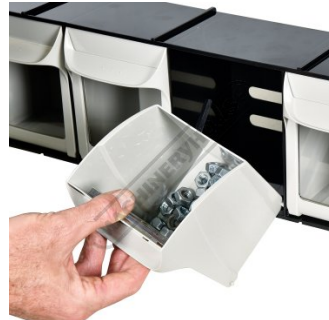
Removable Bins for Easy Access and Refilling