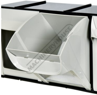
Bins Open to 40 Degree Angle