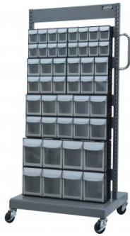
K200 Mobile Storage Bin Systems