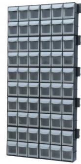
S0353 Parts Storage Bin System