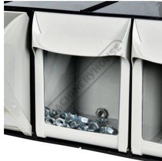
Clear Front Window to Easily Identify Parts