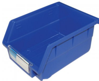
A432 Plastic Bucket