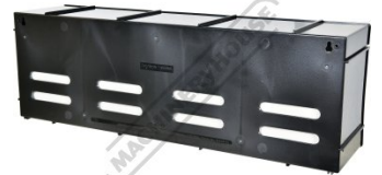
Rear Mounting Holes