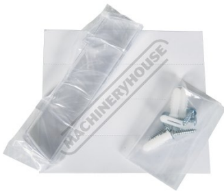
Includes Name Tags and Wall Mount Screws