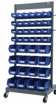
K210 Mobile Storage Bucket Systems Package Deal