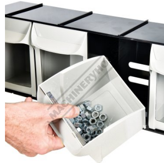
Removable Bins for Easy Access and Refilling