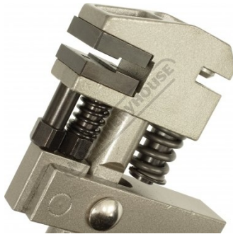
Crimp Flange Close Up