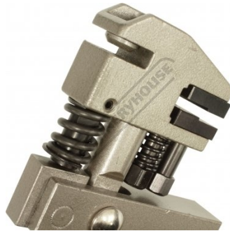
Hole Punch Close Up