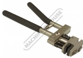
Crimp Flange Top View