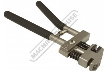
Hole Punch Top View