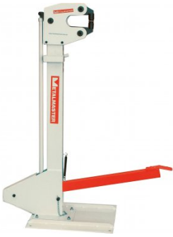
S2264 Foot Operated Shrinker Stretcher - Oval Jaws