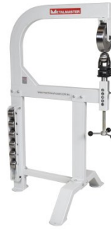
S225 English Wheel