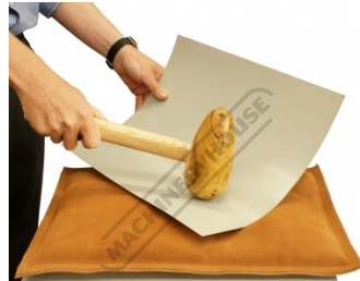
Shown With Nylon Bossing Mallet