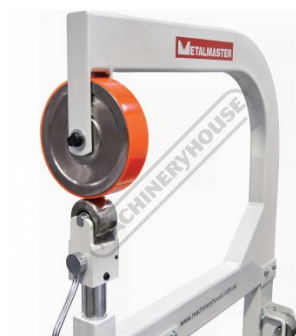
Shown Fitted To Wheel