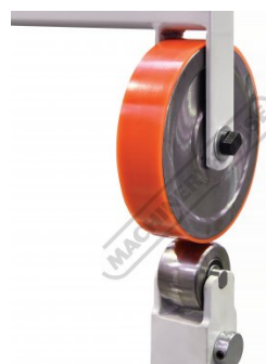
50 8mm Wide