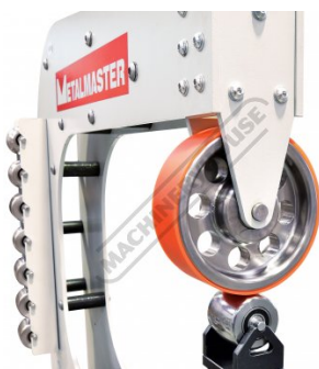
Shown Fitted On Wheel