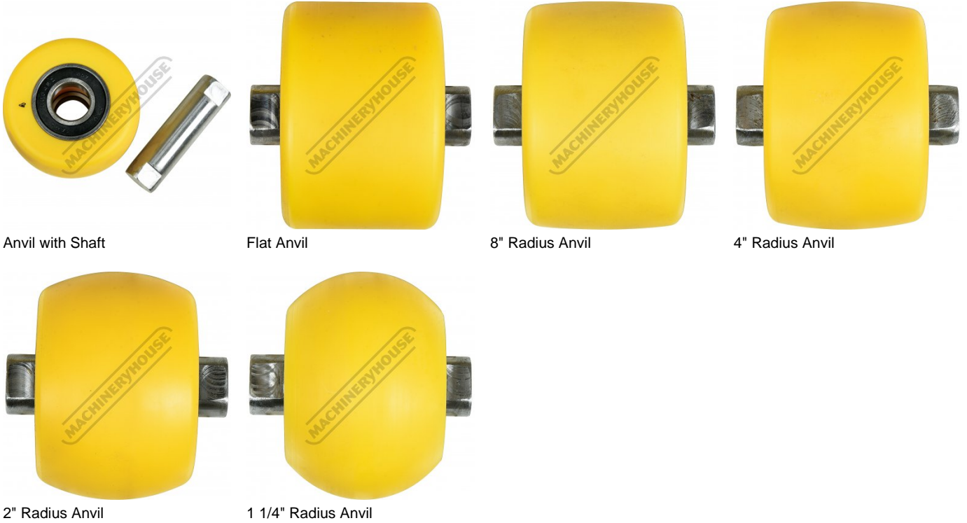
Anvil with Shaft