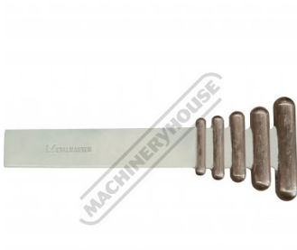
Stacked On Top