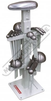
Stand Shown With Optional Dollies