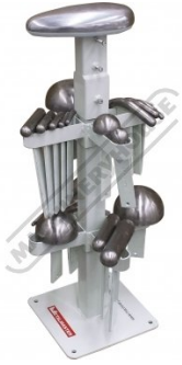
Stand Shown With Optional Dollies