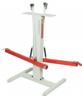
S2263 Shrinker Stretcher Foot Operated Stand