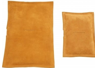
S212 Rectangle Leather Bags - Sand Filled