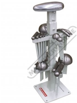
Stand Shown With Optional Dollies