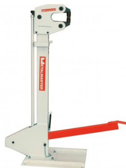
S2264 Foot Operated Shrinker Stretcher - Oval Jaws