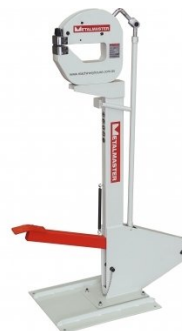
S2266 Foot Operated Shrinker Stretcher - Heavy Duty