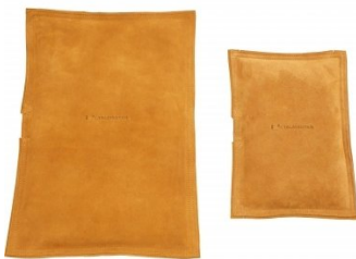
S212 Rectangle Leather Bags - Sand Filled