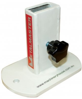
S2239 Dolly Stand Holder