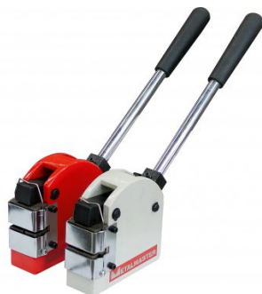
S2262 Shrinker & Stretcher - Bench Mount