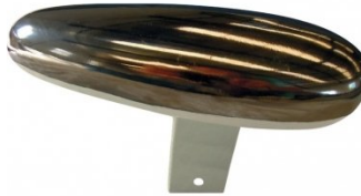
S2236 Oval Steel Dolly