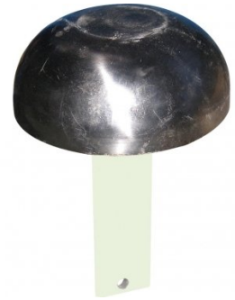
S2237 Bowl Steel Dome Dolly