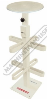
Shown with Optional Stand S2238