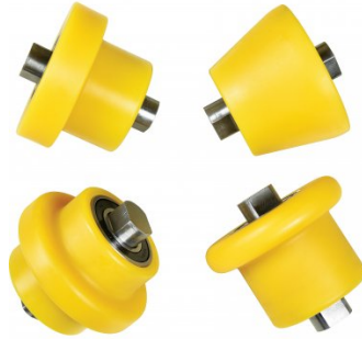
S2172 4pc Nylon Lower Anvil Set