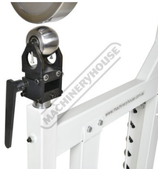
Cam Action Lever on Lower Die Rear View3