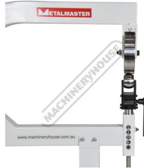
Roller Front View