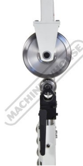
Roller End View