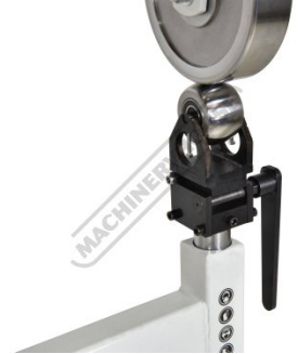
Cam Action Lever on Lower Die Rear View