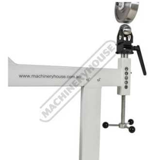
Material Thickness Adjustment Hand Wheel