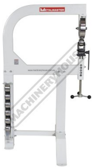
Side View Left