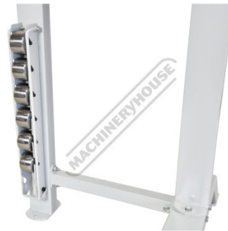
Roller Storage Pack