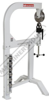
Rear view left