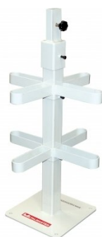
S2238 Steel Dolly Stand