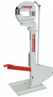
S2266 Foot Operated Shrinker Stretcher - Heavy Duty