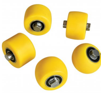
S2170 5pc Nylon Lower Anvil Set