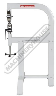
Side view right