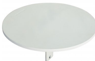
S2240 Round Steel Table for Sand Bag