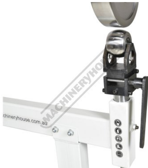
Cam Action Lever on Lower Die Rear View2