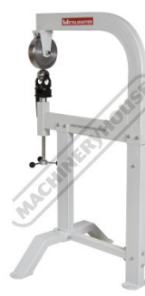
Rear view right