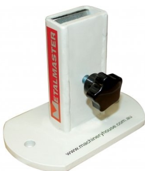
S2239 Dolly Stand Holder