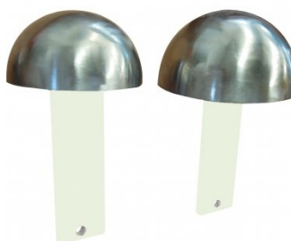
S2236 Oval Steel Dolly