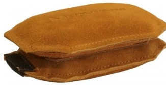
S212 Rectangle Leather Bags - Sand Filled