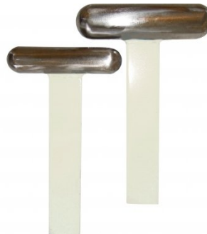
S2232 Tapered Steel T-Dolly Set - 3 Piece