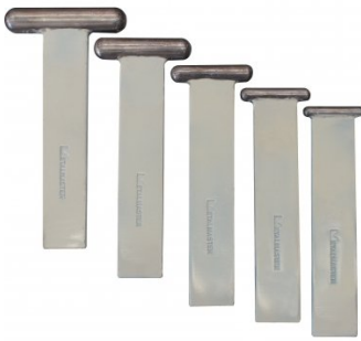
S223 Straight Steel T-Dolly Set Small - 5 Piece