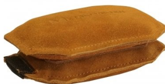
S214 Rectangle Leather Bag - Steel Shot Filled