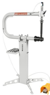
S2277 Pneumatic Planishing Hammer On Stand