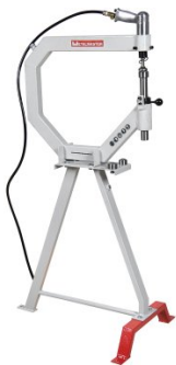
S227A Pneumatic Planishing Hammer