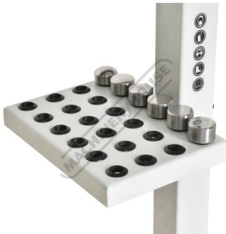
24 Die tray holder