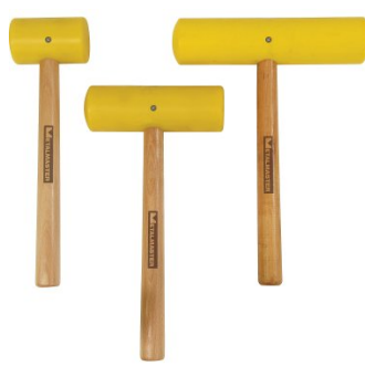
H895 Nylon Bossing Mallet Set - Flat & Radius End