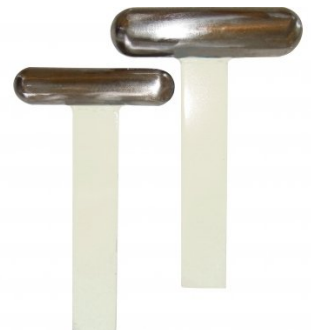
S2231 Straight Steel T-Dolly Set Large - 2 Piece