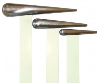
S2232 Tapered Steel T-Dolly Set - 3 Piece