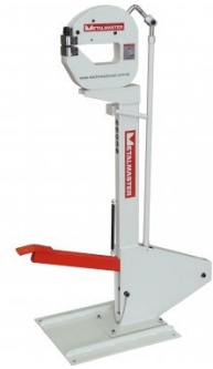
S2266 Foot Operated Shrinker Stretcher - Heavy Duty