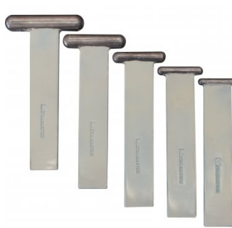
S223 Straight Steel T-Dolly Set Small - 5 Piece