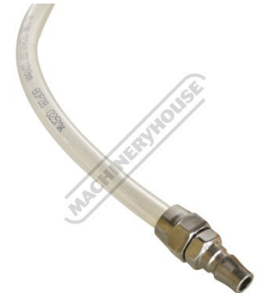
Air in Adaptor