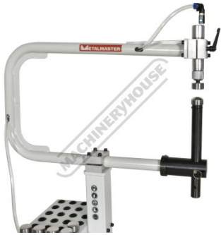
Large throat capacity 610mm deep and 362mm height