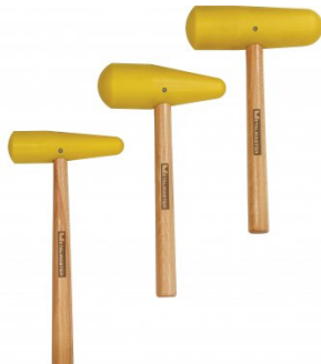
H896 Nylon Bossing Mallet Set - Tapered & Radius Ends