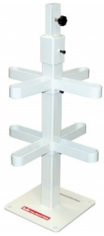
S2238 Steel Dolly Stand