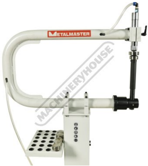
Large Throat Capacity 710 360mm Height