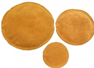
S210 Round Leather Bags - Sand Filled