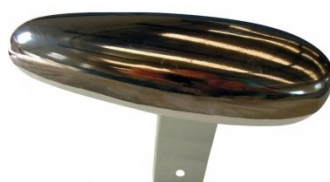
S2236 Oval Steel Dolly