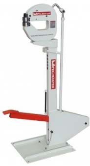
S2266 Foot Operated Shrinker Stretcher - Heavy Duty