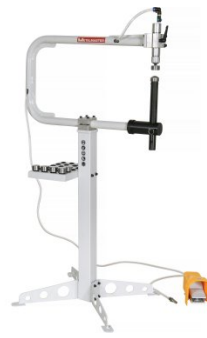
S2275 Pneumatic Planishing Hammer On Stand