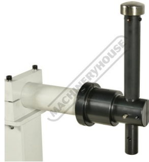
Lower Die Holder