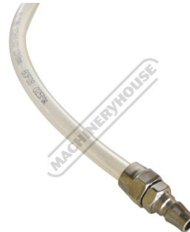
Air in Adaptor