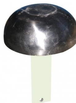
S2237 Bowl Steel Dome Dolly