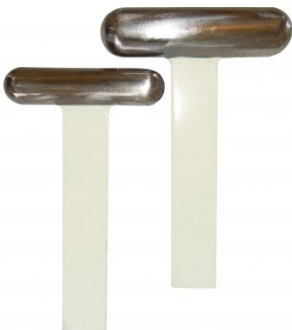
S2231 Straight Steel T-Dolly Set Large - 2 Piece