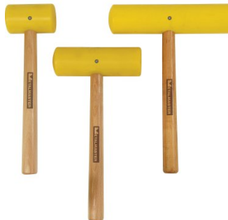
H895 Nylon Bossing Mallet Set - Flat & Radius End