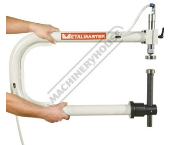
Show in Hand Held Planishing