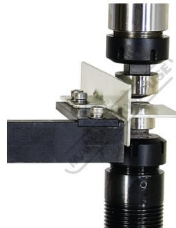
Adjustable Back Stop