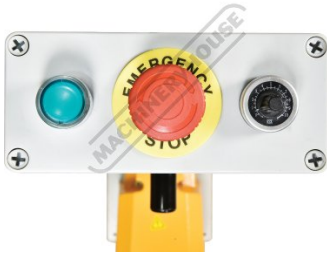
Power and Speed Control