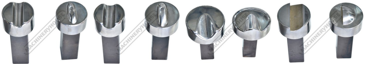
1 x Set of 3/8 Inch Beading Dies (22mm square shank) 1 x Set of 1/2 Inch Beading Dies (22mm square shank) 1 x Set of Thumbnail Shrinking Dies (22mm square shank) 1 x Set of Louvre Dies (22mm square shank)