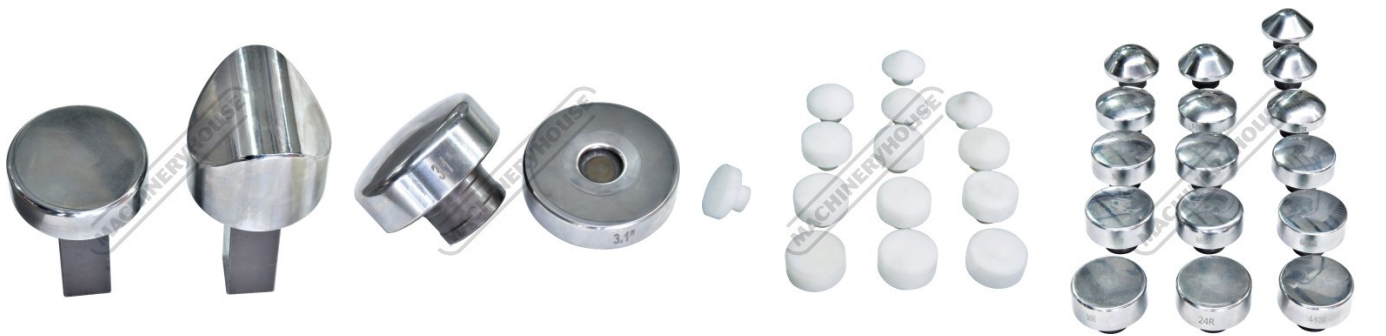
1pc x Linear Stretching Die and Upper Die (22mm square shank) 1 x Set of 3.1 Inch Doming Dies (Ø30 x 20mm round shank) Nylon Lower Dies and Upper Die (Ø30 x 20mm round shank) Steel Lower Dies (Ø30 x 20mm round shank)