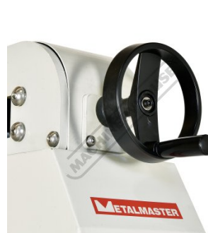
Stroke Adjustment Hand Wheel