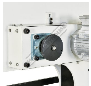
Top Tool Adjustment Hand Wheel