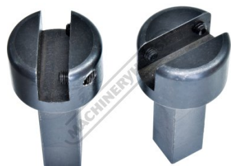
1 x Set of Universal Die Holders - 16mm opening (22mm square shank)