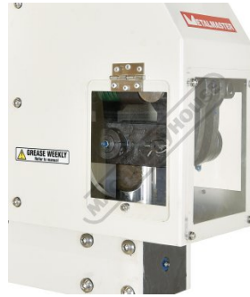
Clear Viewing Window for Adjustment Settings