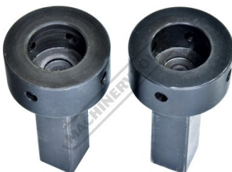
1 x Set of Round Die Holders - Ø30 x 20mm (22mm square shank)