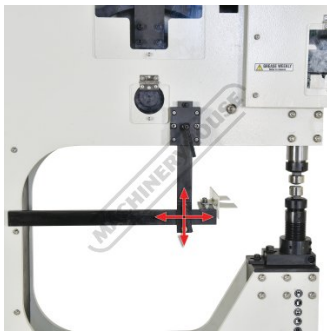
Stop Adjustable Depth Positions