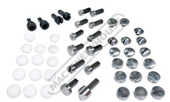
Included Dies and Holders