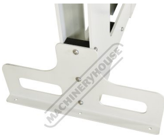
Wide Feet with Anchor Holes