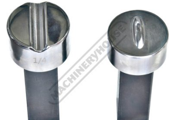
1 x Set of 1/4 Inch Beading Dies (22mm square shank)