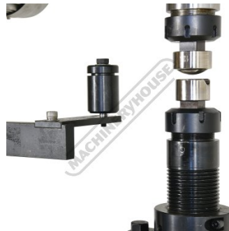
Round Roller Guide