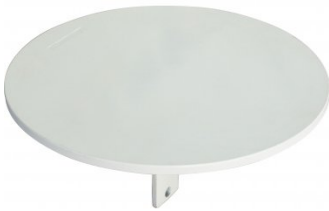
S2240 Round Steel Table for Sand Bag