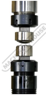
Quick Change Tooling