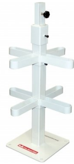
S2238 Steel Dolly Stand