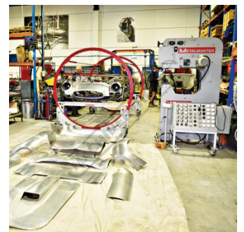
All Car Parts Made on Power Hammer