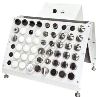
Die Holder and Power Box