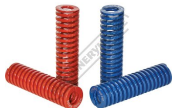
Soft, Medium & Hard Springs (Medium are Factory Fitted)