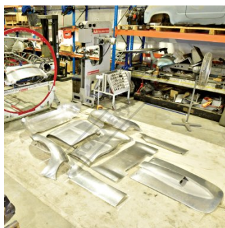
All These Car Parts Made on Power Hammer