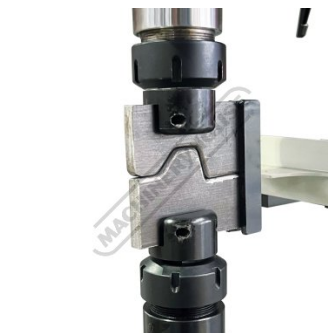
Shown Set up with Optional Custom Made Tooling