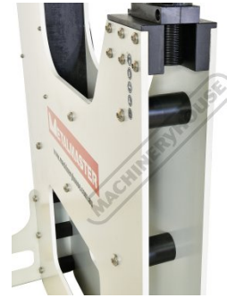
14mm Thick Steel Frame