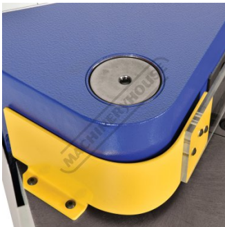
Heavy Duty Pins