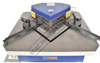
Top Close Up