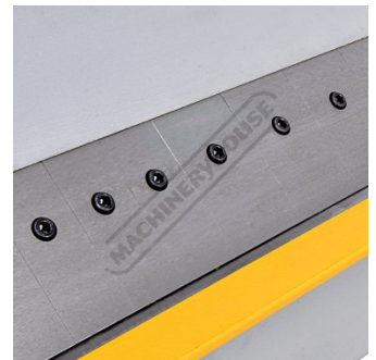
Removable Fingers for Bending Pans or Boxes