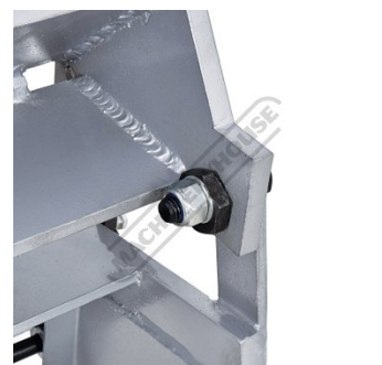
Clamp Leaf Setback Adjustment