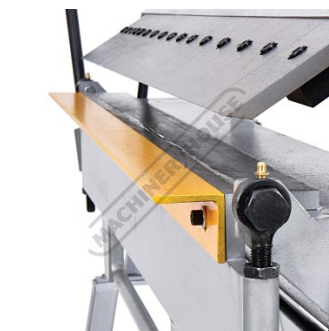
Removable Lower Bending Support Angle