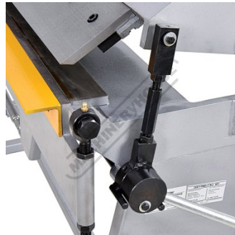
Lubrication Points Right Side