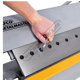
Removable Fingers Action Hex Key