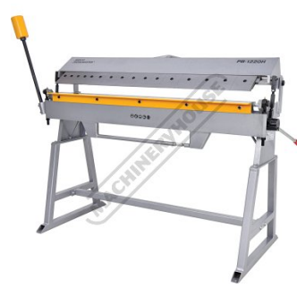
Shown with Material Clamp Blade Up