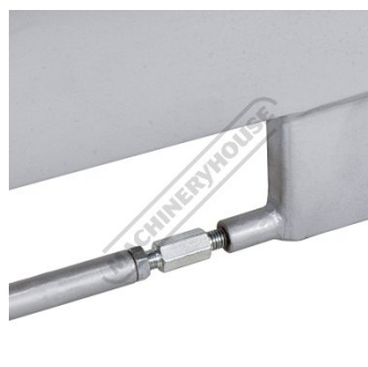
Crown Adjustment Rod