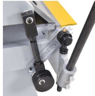
Lubrication Points Left Side