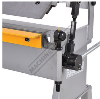
Lower Bending Leaf Height Adjustment