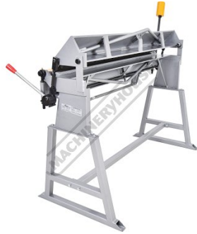
Rear Left View 2