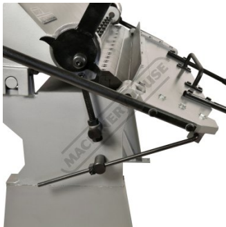
Adjustable Apron Stop