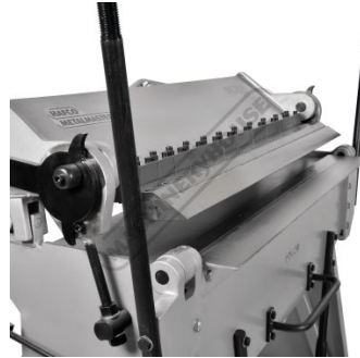
1250mm Material Clamp Capacity