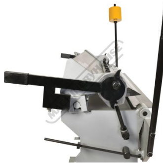
Material Clamp Blade Lever