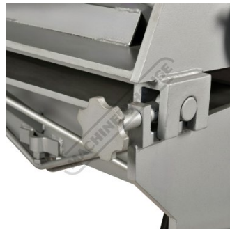
Material Thickness Adjustment