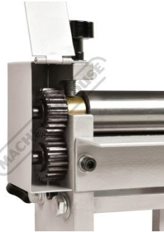
Gear Driven Rolls