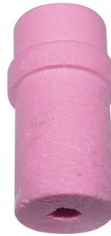
6SC0059 NOZZLES 4.0 MM PKT 2