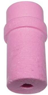
6SC0060 NOZZLES 5.0MM PKT 2