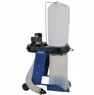
W886 Dust Collector