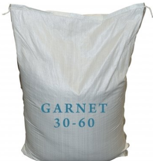
S296 Sandblasting Beads - Garnet