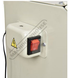
Switches for Light and Dust Collector