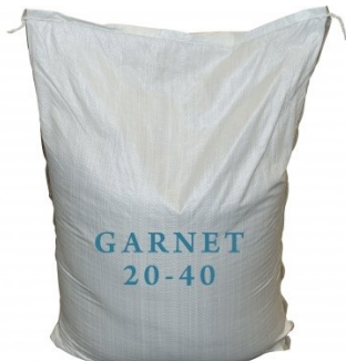
S295 Sandblasting Beads - Garnet