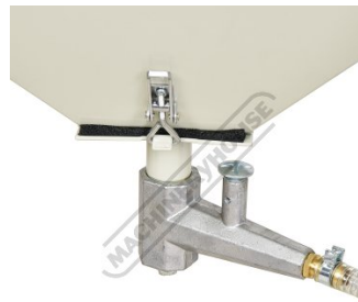
Abrasive Measuring Valve