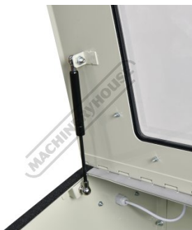
Gas Strut Door