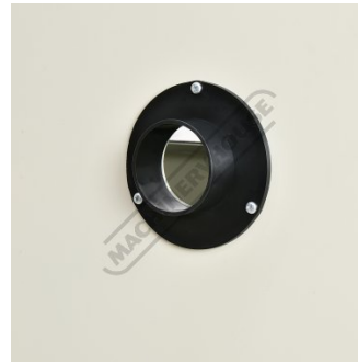
Dust Collector 63mm Outlet