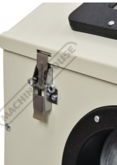
Lid Open Latch