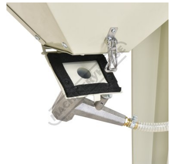
Hopper Emptying Hatch