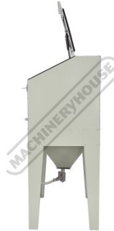
Side View Lid Open