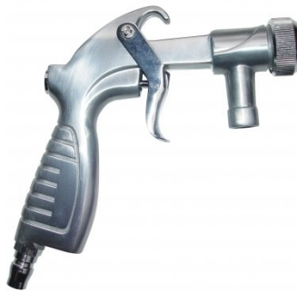
6SC0042 SANDBLASTING GUN