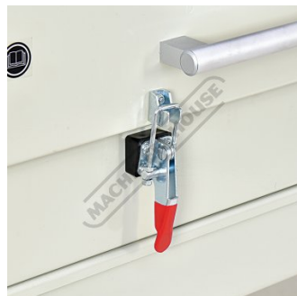
Lid Open Latch