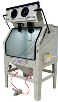
Side View Lid Open