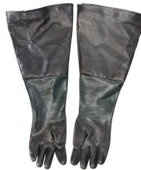
2SC0035 GLOVES PAIR