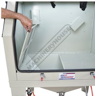
Hopper with Removable Gates