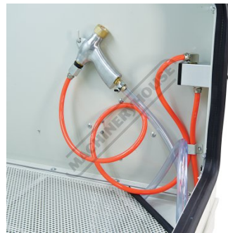
Gun on Hanging Hook