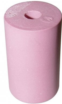
3SC0206 CERAMIC NOZZLE 6MM PKT 2