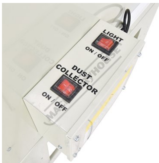
Switches for Light and Dust Collector