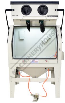
Front View Lid Open