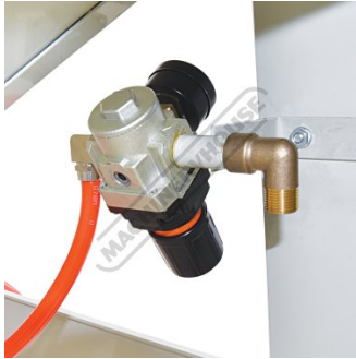
Compressed Air Inlet Connection