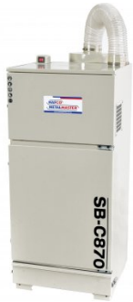
S310 Industrial Sandblasting Dust Cyclone Extractor