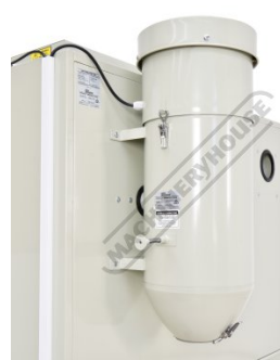
Dust Collector and Filter System