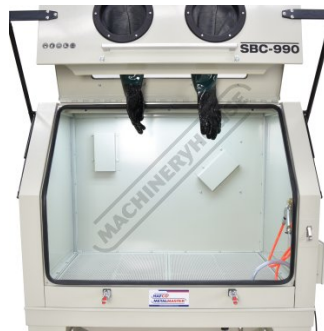
Inside Work Area