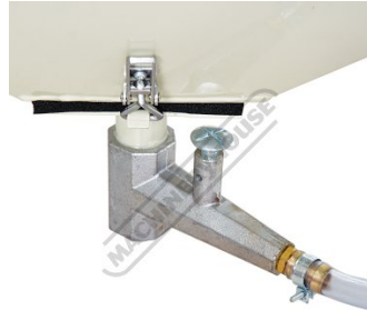
Abrasive Metering Valve