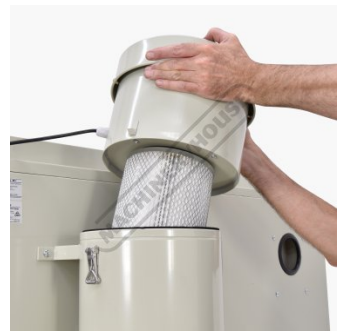
Removing Motor Filter Assembly