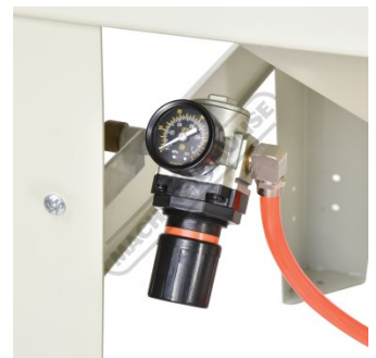
Air Pressure Gauge