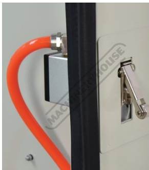
Door Safety Interlock