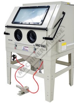
Side View Lid Closed