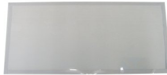
7SC0024 PVC SHEET PKT 4