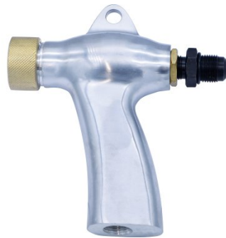
3SC0300 SANDBLASTING GUN