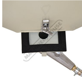
Hopper Emptying Hatch