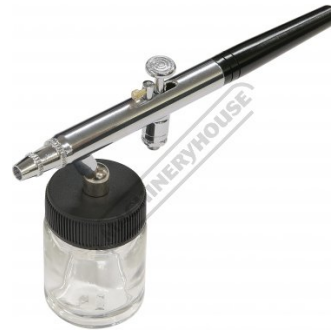
Air Brush with Paint Jar