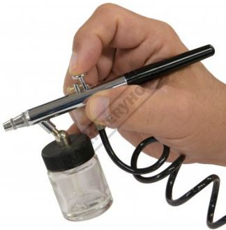
Shown Holding Air Brush