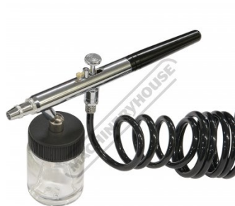
Air Brush Paint Valve Release