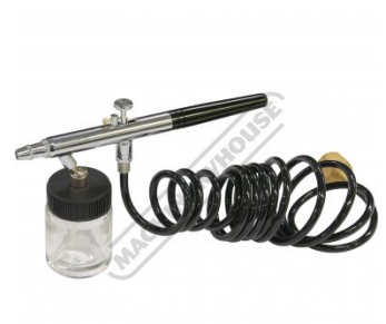
Air Brush with Hose & Paint Jar