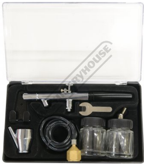
Complete Kit In Case