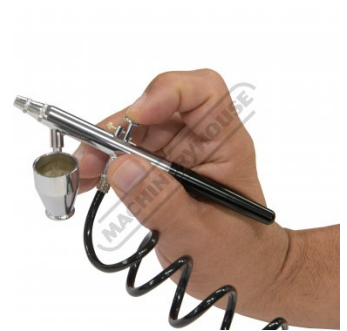
Shown In Use Paint Cup