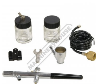
Air Brush Kit