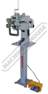
Shown On Optional Stand (B047)