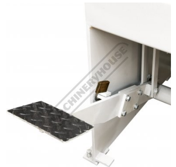
Foot Pedal Lever Shown Locked with Optional Padlock