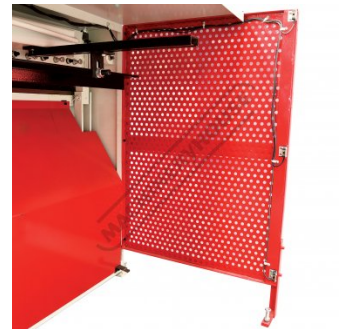
3 x Rear Safety Photoelectric Sensors