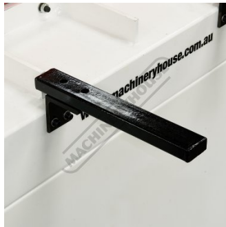
Front Sheet Supports