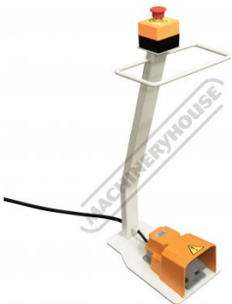
Roving Foot Pedal with Emergency Stop