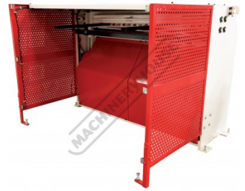
Rear Right View