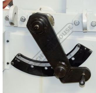
Rapid Blade Adjustment For Material Thickness