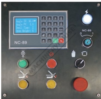
NC 89 Control Panel