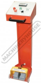
Roving Foot Controls