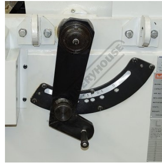
Rapid Blade Adjustment for Material Thickness