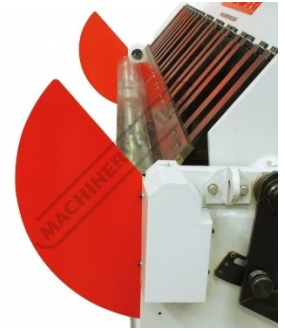
Apron Safety Guards