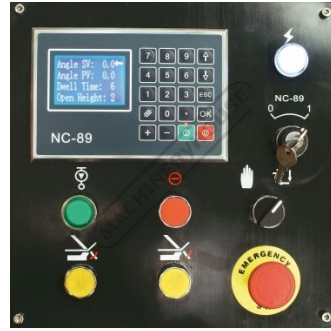
NC 89 Control Panel