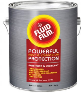
O044 Rust & Corrosion Preventive