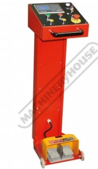
Roving Foot Pedal