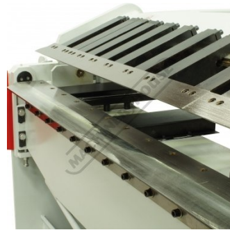
Shown With Material Clamp Beam Open