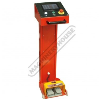
Roving Foot Pedal