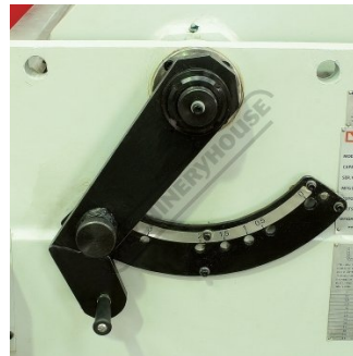
Rapid Blade Adjustment for Material Thickness