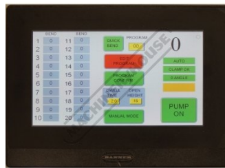
NC Ezytouch Main Page