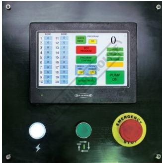
NC Ezytouch Control Panel