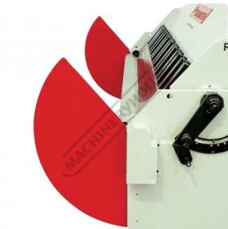
Apron Safety Guards