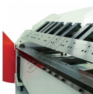
Shown with Material Clamp Beam Open