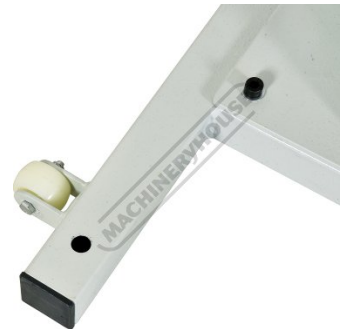
2 x Rear Wheels For Mobility