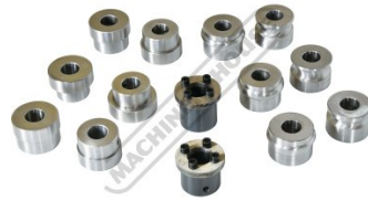
Die Set Included