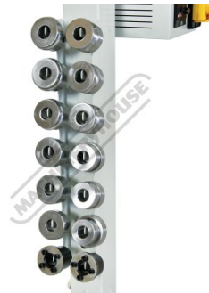
Die Rack Holder