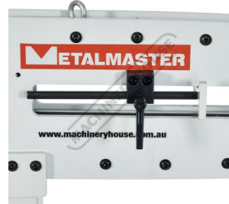
Adjustable Material Depth Stop