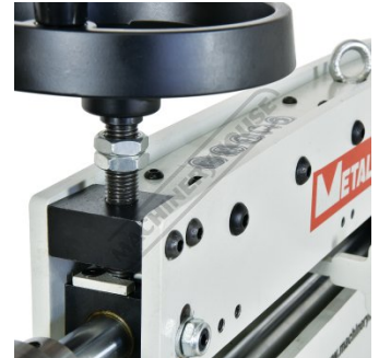
Dual Wall Frame