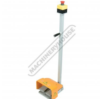
Forward & Reverse Foot Control With Emergency Stop Switch