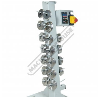
Die Rack Holders Left View