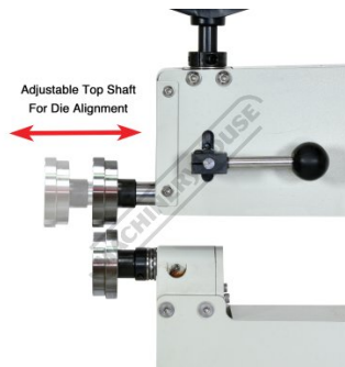
Adjustable Top Roller