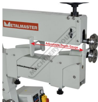
Adjustable Depth Gauge