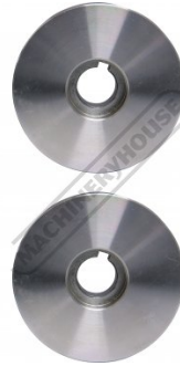
Narrow Blank Roller Front View