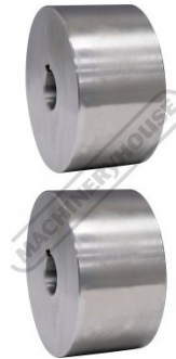
Wide Blank Roller Set Rear View