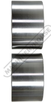
Set 3 Side View