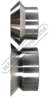
Set 1 Side View