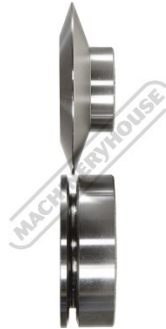
Set 2 Side View