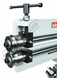
Shown With 1/2" (12.7mm) Beading Rolls