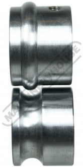
3/8 Inch (9.5mm) Beading Rolls