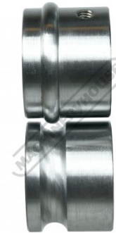
1/4 Inch (6.35mm) Beading Rolls