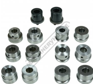
Includes 7 Sets of Rolls