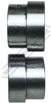
1/8 Inch (3mm) Flange Rolls