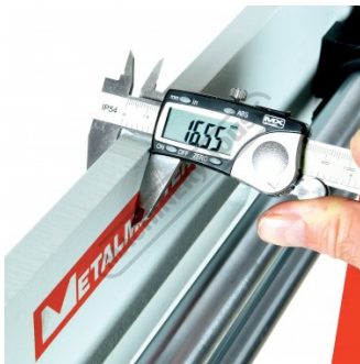
16mm Plate Steel