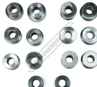
Rolls Sets Rear View