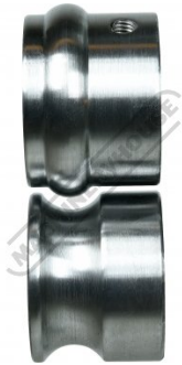
1/2 Inch (12.7mm) Beading Rolls