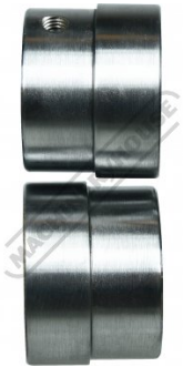
1/16 Inch (1.6mm) Flange Rolls