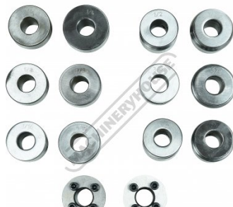
Roll Sets Top View