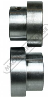
1/4 Inch (6.35mm) Flange Rolls